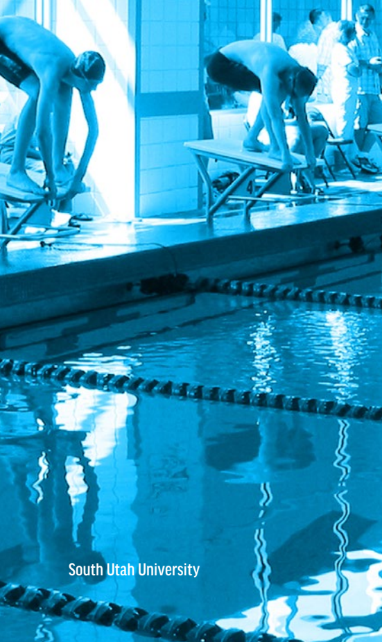
South Utah University