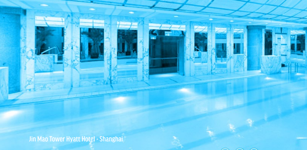
Jin Mao Tower Hyatt Hotel - Shanghai