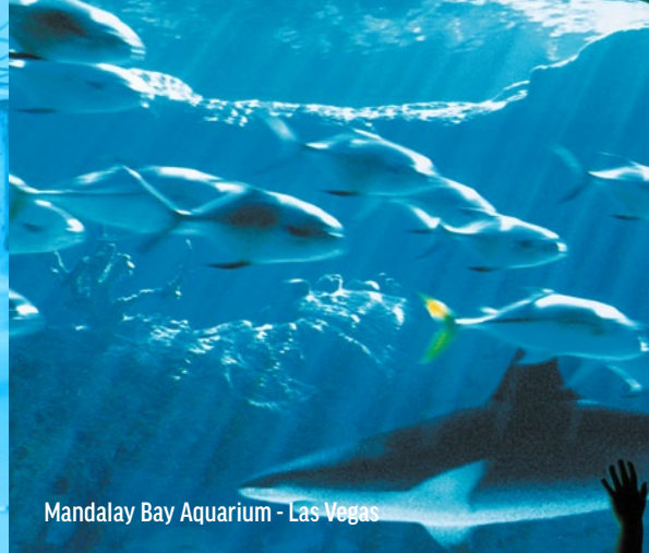
Mandalay Bay Aquarium - Las Vegas